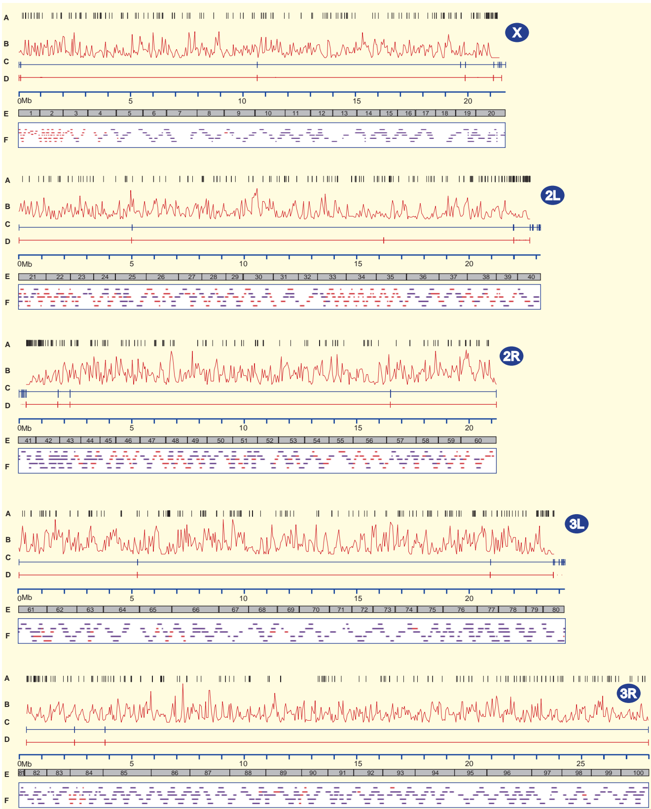
Fig. 3. Assembly status of the Drosophila genome. Each chromosome arm is depicted with information on content and assembly status: (A) transposable elements, (B) gene density, (C) scaffolds from the joint assembly, (D) scaffolds from the WGS-only assembly, (E) polytene chromosome divisions, and (F) clone-based tiling path. Gene density is plotted in 50-kb windows; the scale is from 0 to 30 genes per 50 kb. Gaps between scaffolds are

represented by vertical bars in (C) and (D). Clones colored red in the tiling path have been completely sequenced; clones colored blue have been draft-sequenced. Gaps shown in the tiling path do not necessarily mean that a clone does not exist at that position, only that it has not been sequenced. Each chromosome arm is oriented left to right, such that the centromere is located at the right side of X, 2L, and 3L and the left side of 2R and 3R.